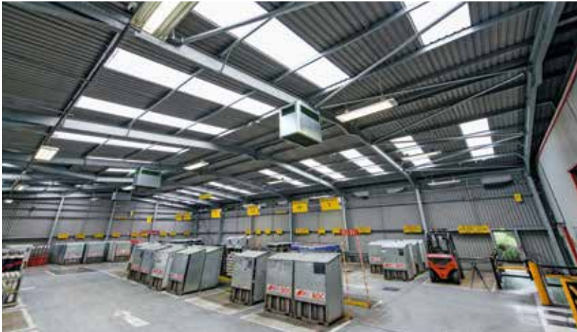
The physical cloud of dust hanging in the working environments has been replaced by air purification systems.