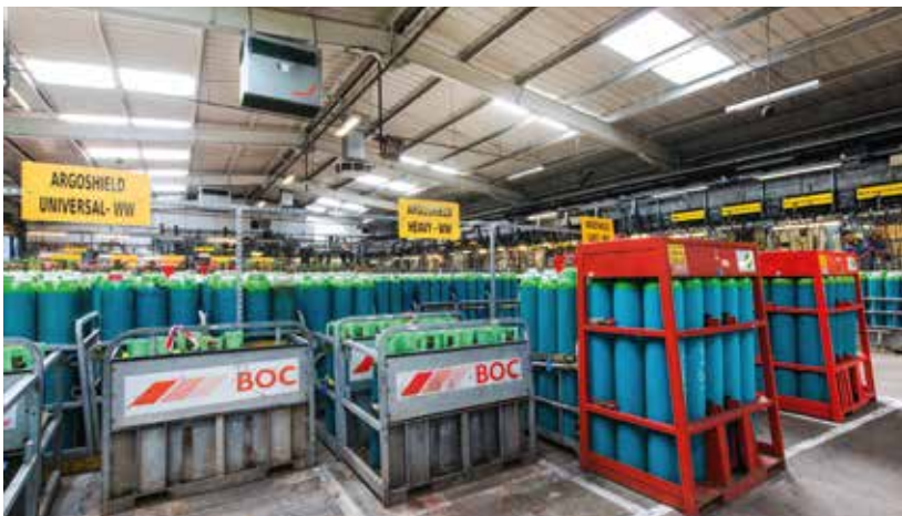
Happy customers: BOC can now deliver their gas cylinders in a much better, cleaner condition.